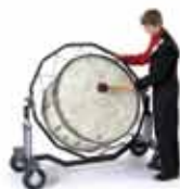
Bass Drum / Gong Cart