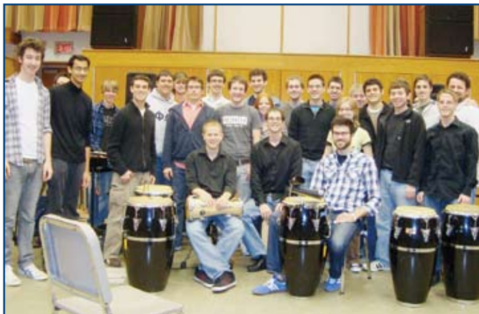
Spectrum Trio with the University of Michigan Percussion Studio

The Spectrum Trio , on their way to a PASIC 2009 World Music clinic/performance, presented clinics for the University of Wisconsin–Madison and University of Michigan, which encompassed their original compositions as well as compositional concepts and inspirations. ▶